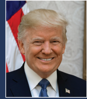
Donald Trump Republican