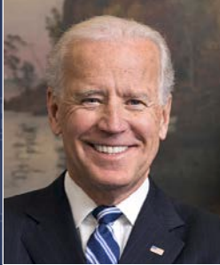
Joe Biden Democrat