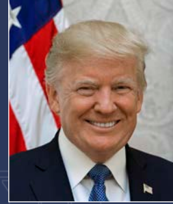
Donald Trump Republican