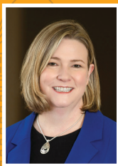
NAN WHALEY Democrat