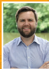
J.D. VANCE Republican